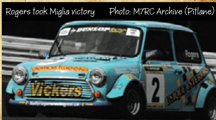
Rogers took Miglia victory