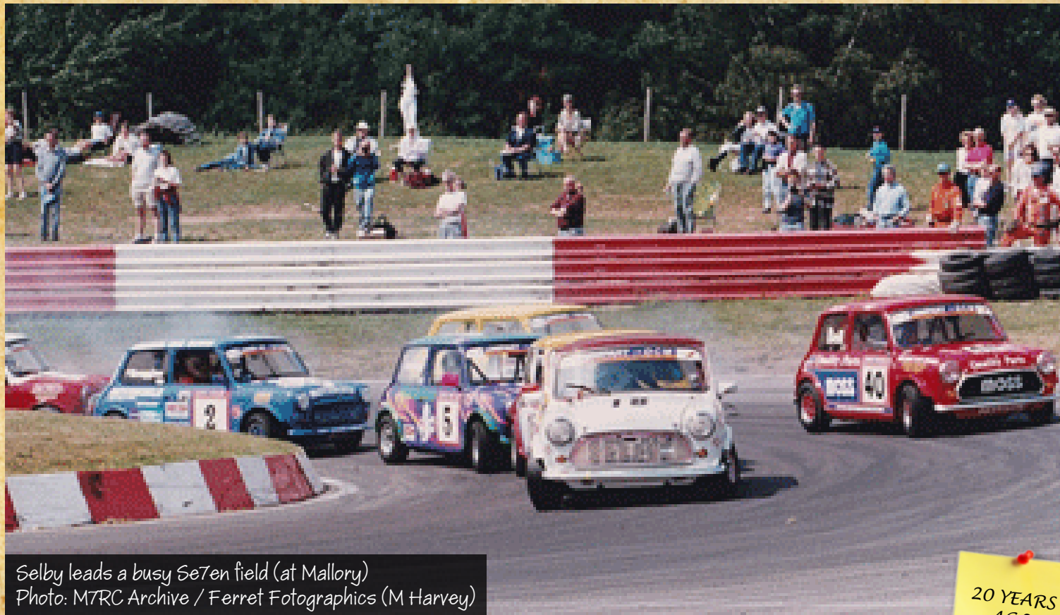
Selby leads a busy Se7en field (at Mallory)