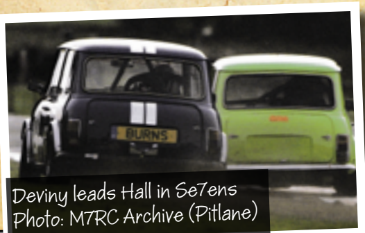
Deviny leads Hall in Se7ens